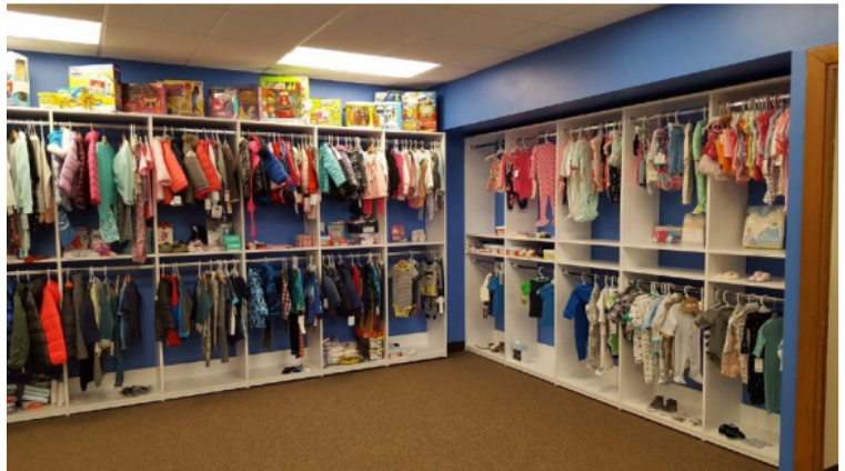
Promise Place is a clothing and supply closet where families can get assistance with items to support the basic needs of their children ages 0-6