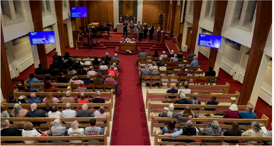
Maundy Thursday: Multi-congregational worship service.