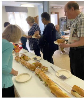
Fellowship lunch: Second Sunday Sandwich and Salad