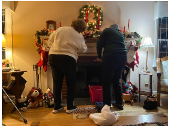
A little smoke at the Burney house wasn't about to put a damper on the Tabitha celebration!